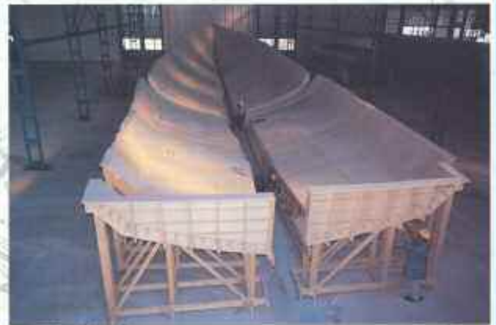
The largest yacht (46 m long) in Turkey is under construction in our rented yacht hangar.

A DOPORT with infrastructure and buildings near the sea, is capable of providing any kind of service to all yacht builders who want to built new yachts and yacht shells in Antalya Free Zone with the great incentive support of Antalya Free Zone Regulations in Turkey.