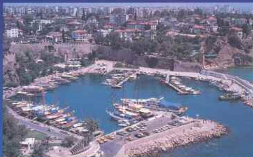
Antalya Yacht Harbour