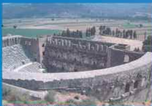
Aspendos Antic Theatre

Antalya, with its new-build international airport, cruiser port, natural beauty and rich history, is the tourism centre and principal holiday resort of Turkey.