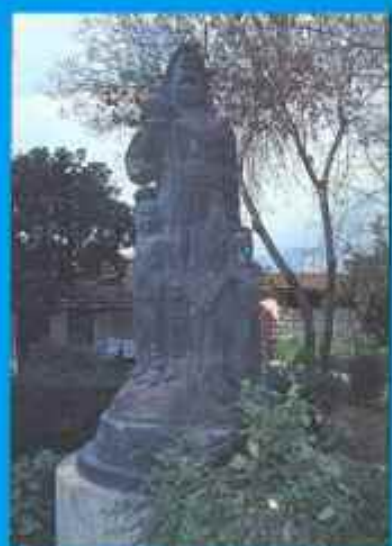
Myra - St. Nicholas