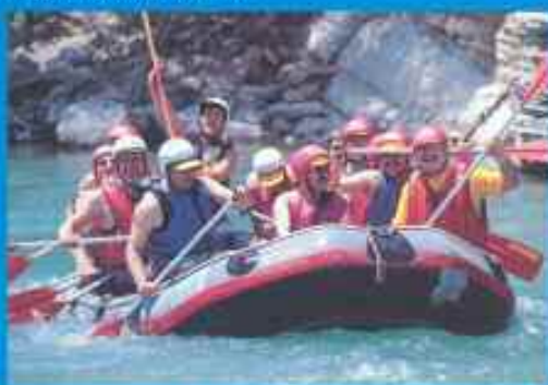
Köprülü Canyon - Rafting

In March and April you can ski in Saklıkent in the morning and in the afternoon sunbathe or swim in the warm waters of the Mediterranean .