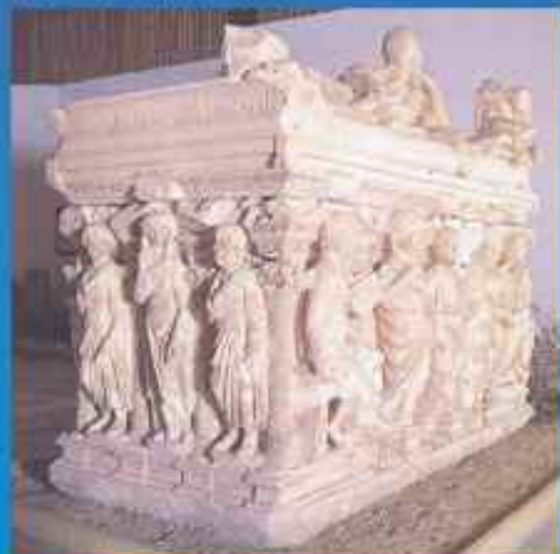
The Archeological Museum

Antalya, with its new-build international airport, cruiser port, natural beauty and rich history, is the tourism centre and principal holiday resort of Turkey.