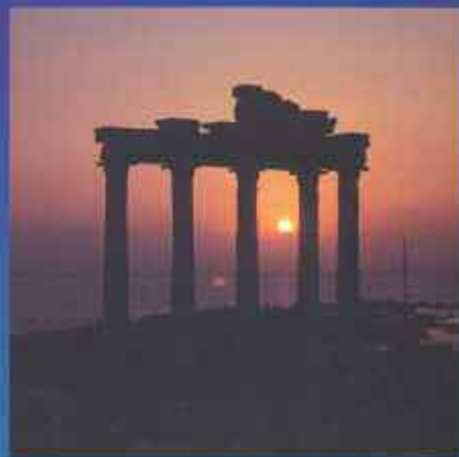
Side - The Temple of Apollo