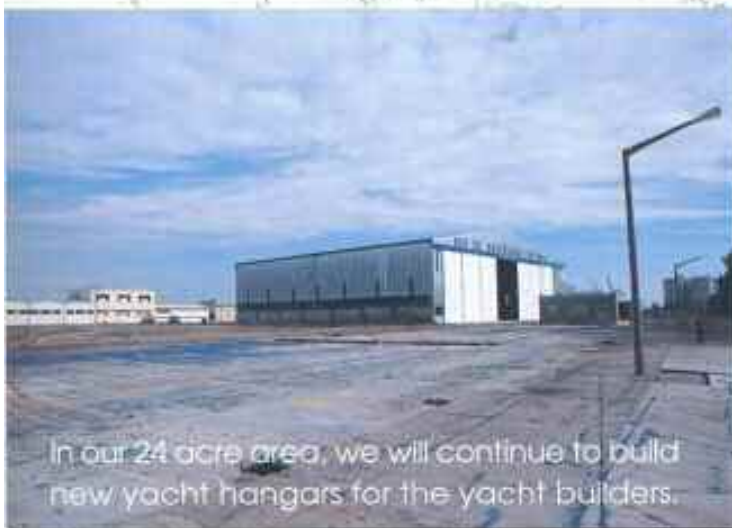
In our 24 acre area, we will continue to build new yacht hangars for the yacht builders.