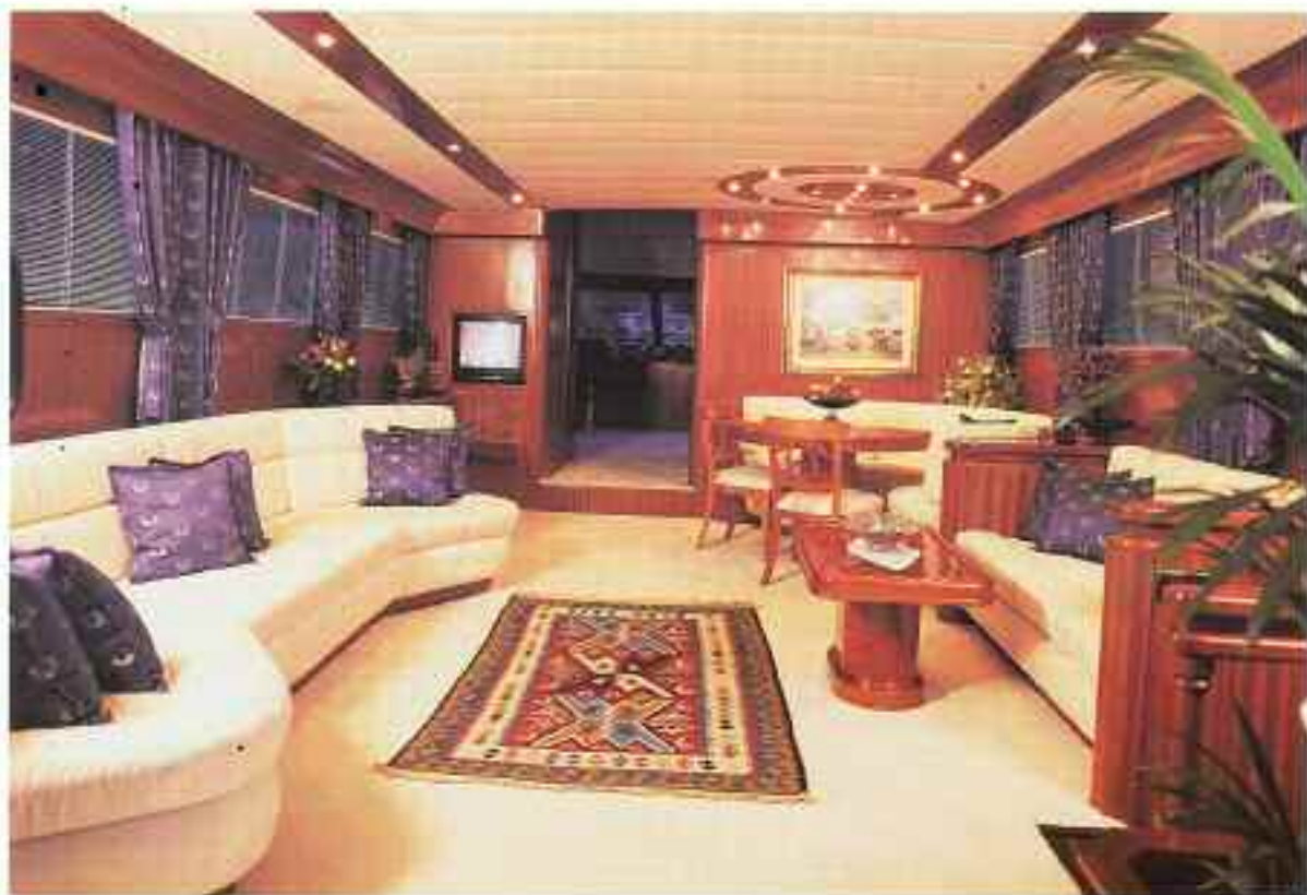
The warm luxury of the saloon, as seen from the bow.