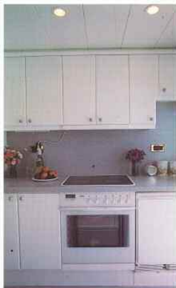
The galley is well organized in terms of its spaces and equipment.