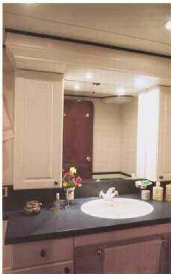
The owner's bathroom, which offers a separate shower compartment