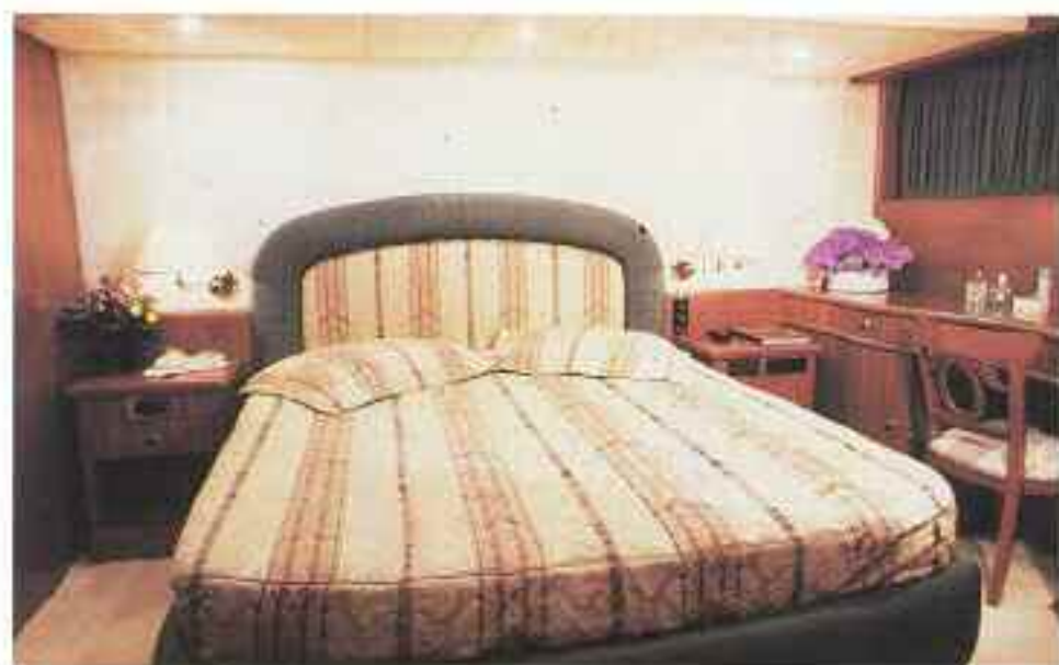
The owner's cabin has a wardrobe, a writing desk and corner space for a TV set.