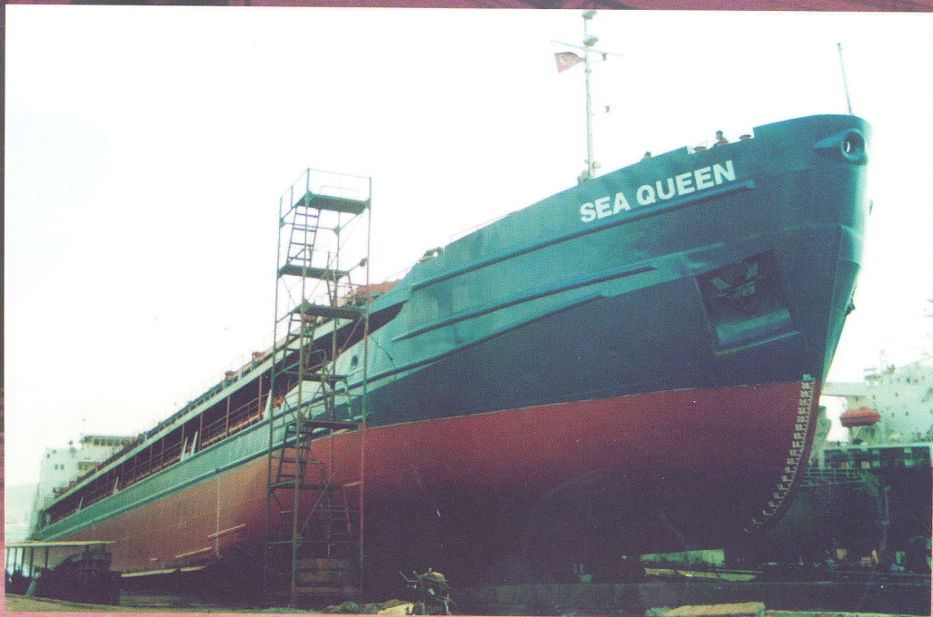
Drydocking of upgraded Volgadon type vessel