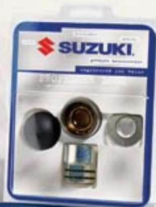
99105-30003 propeller lock