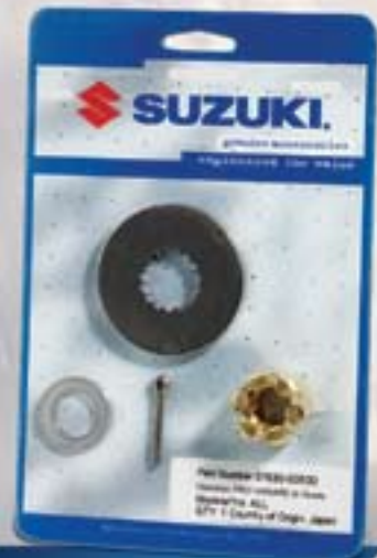
57630-92E00 propeller hardware kit