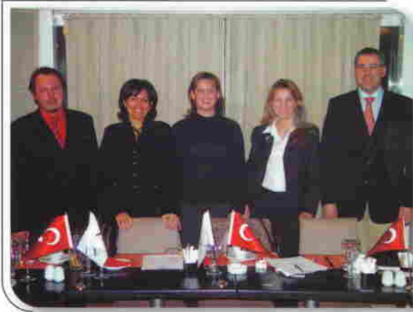
Turkish Bunker Association Board of Directors 2006/2007

Turkish Bunker Association which represents all bunker sector in Turkey had their Great Assembly on December 5th, 2005. The new Board of Directors for the coming two years period is as follows: