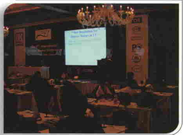
International Bunker Conferences Every 2 years

Chairman Vice Chairman Secretary Treasurer Member