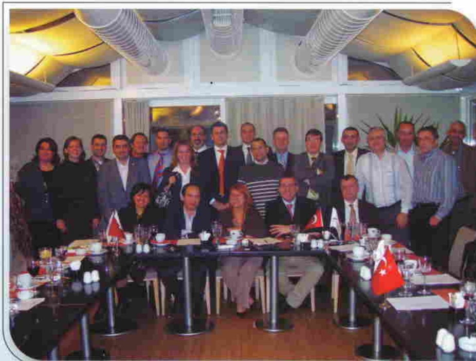
Turkish Bunker Association Members

CYE Petrol / Istanbul Lukoil Turkey / Istanbul Energy Petrol / Istanbul Shell Turkey / Istanbul Asmira Petrol / Izmir